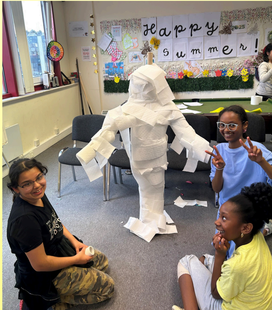
Some of the fun that was had at Summer Club 2025. We're doing it all again very shortly!

Any questions, you can contact the team at summerclub@nwmf.org.uk .