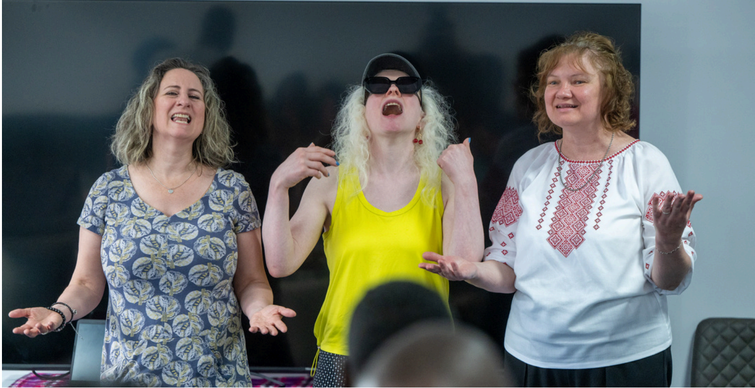
The fabulous Songs Without Borders who added so much to the day with their renditions of, among others, Bella Ciao.