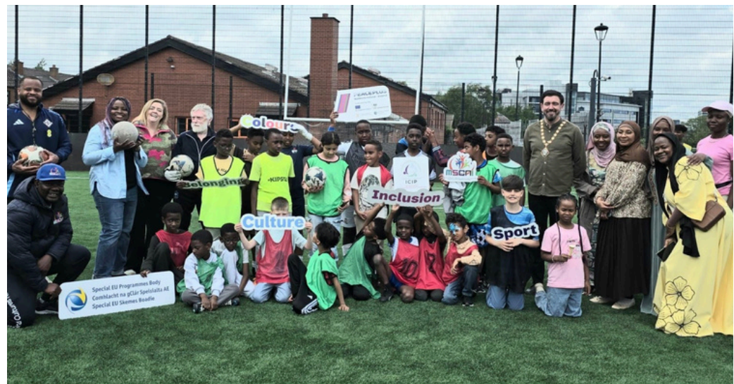
An MSCNI event held recently in Belfast as part of the ICI Programme.