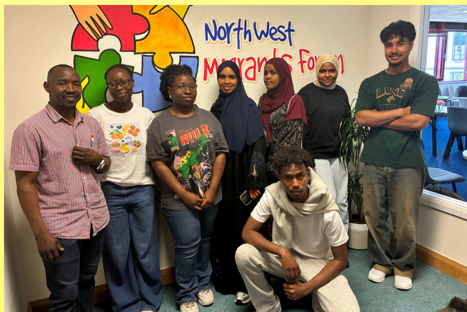
And, pictured at a youth training session are some of the young people who will be co-ordinating this year's Summer Club.