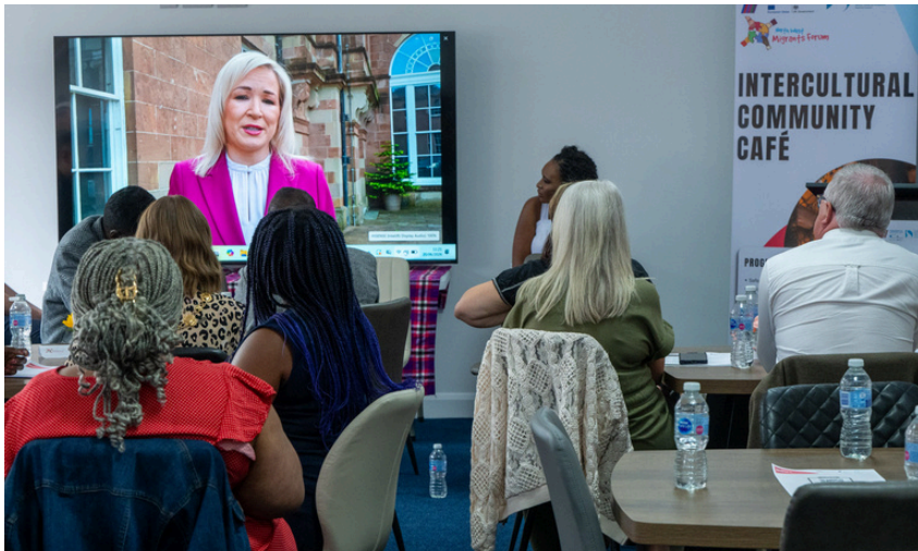
First Minister Michelle O'Neill who sent a recorded message, wishing us well on the launch of our café