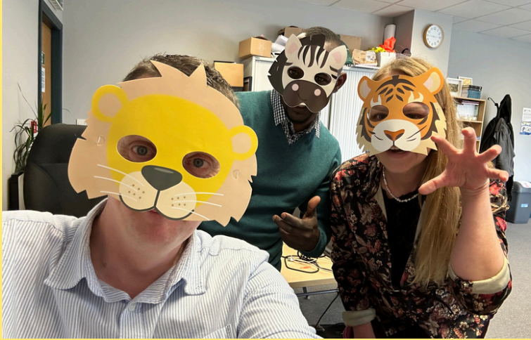
Left: Staff enjoying another normal day in North West Migrants Forum...