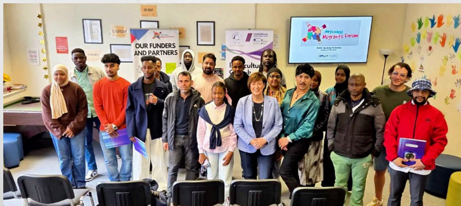
Some of those undertaking the public speaking and confidence building training as part of Voices for Change.