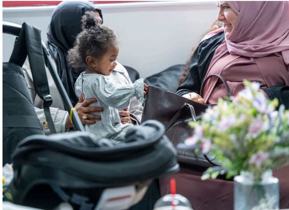
One of the youngest audience members to attend the launch.