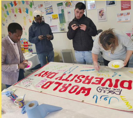
Gearing up for our Integration Craic event which took place on May 21 - World Diversity Day.